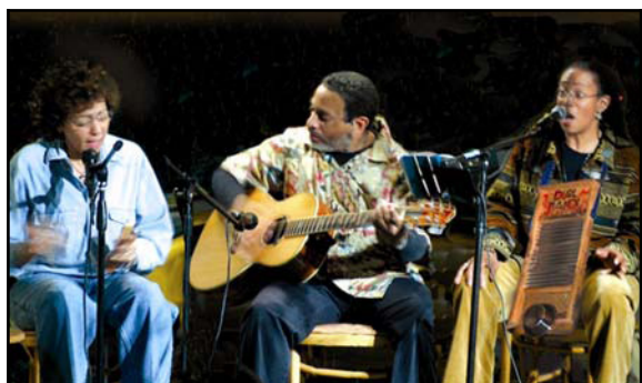
Richmond Folk Music Concert