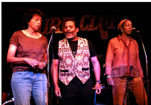
DC Blues Society "Battle of the Bands"