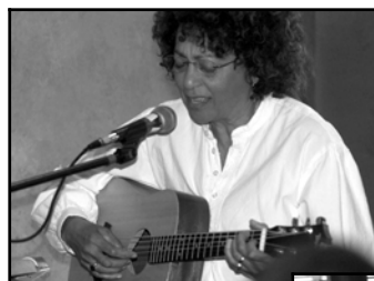
CD Release Party @ Granby North

Numerous Festivals throughout the Region